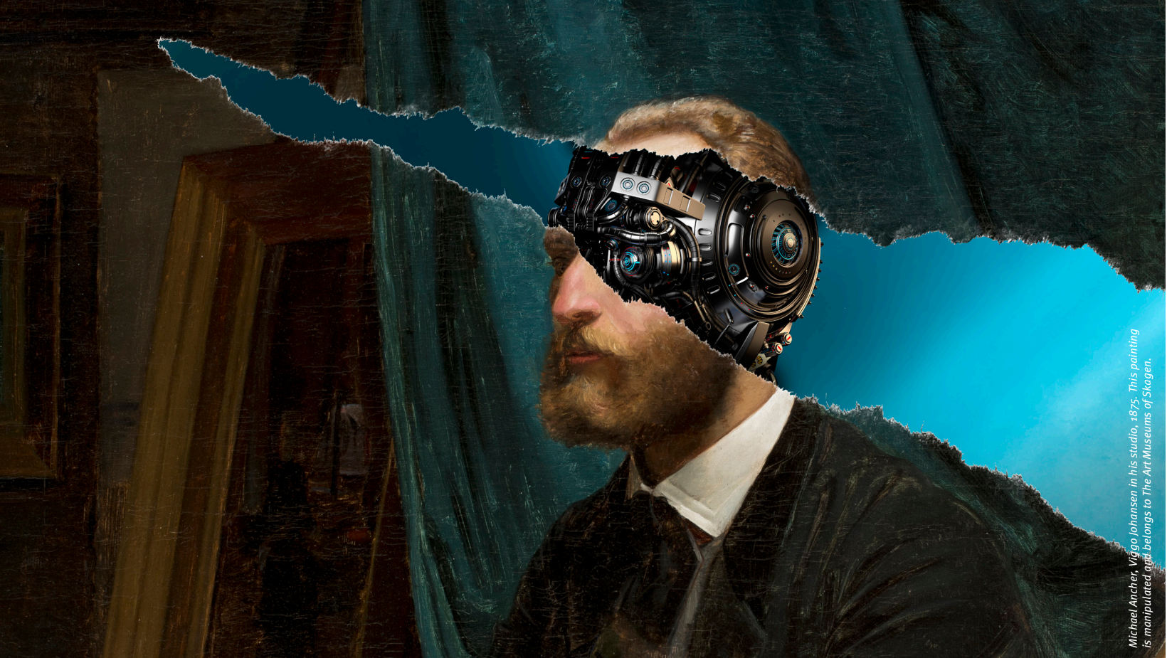
Michael Ancher, Viggo Johansen in his studio , 1875. This painting is manipulated and belongs to The Art Museums of Skagen.